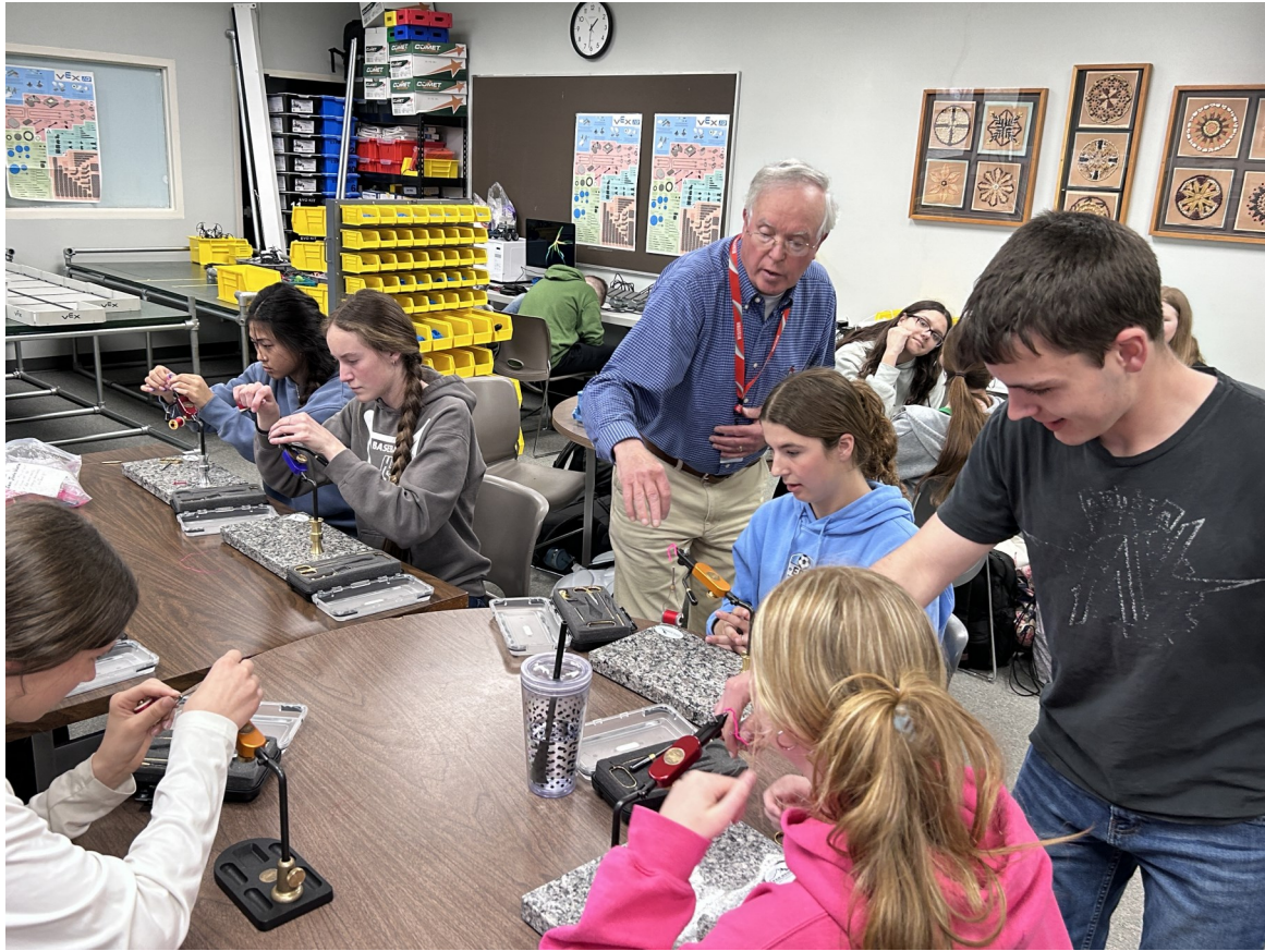
Hughesville High School Fly Fishing Club all girls fly tying