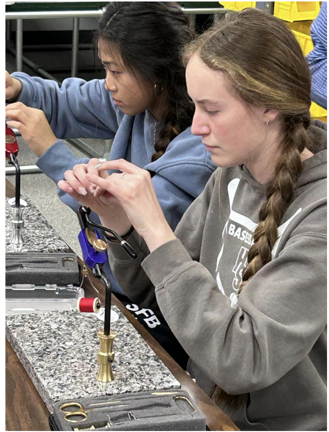
Hughesville High School Fly Fishing Club all girls fly tying