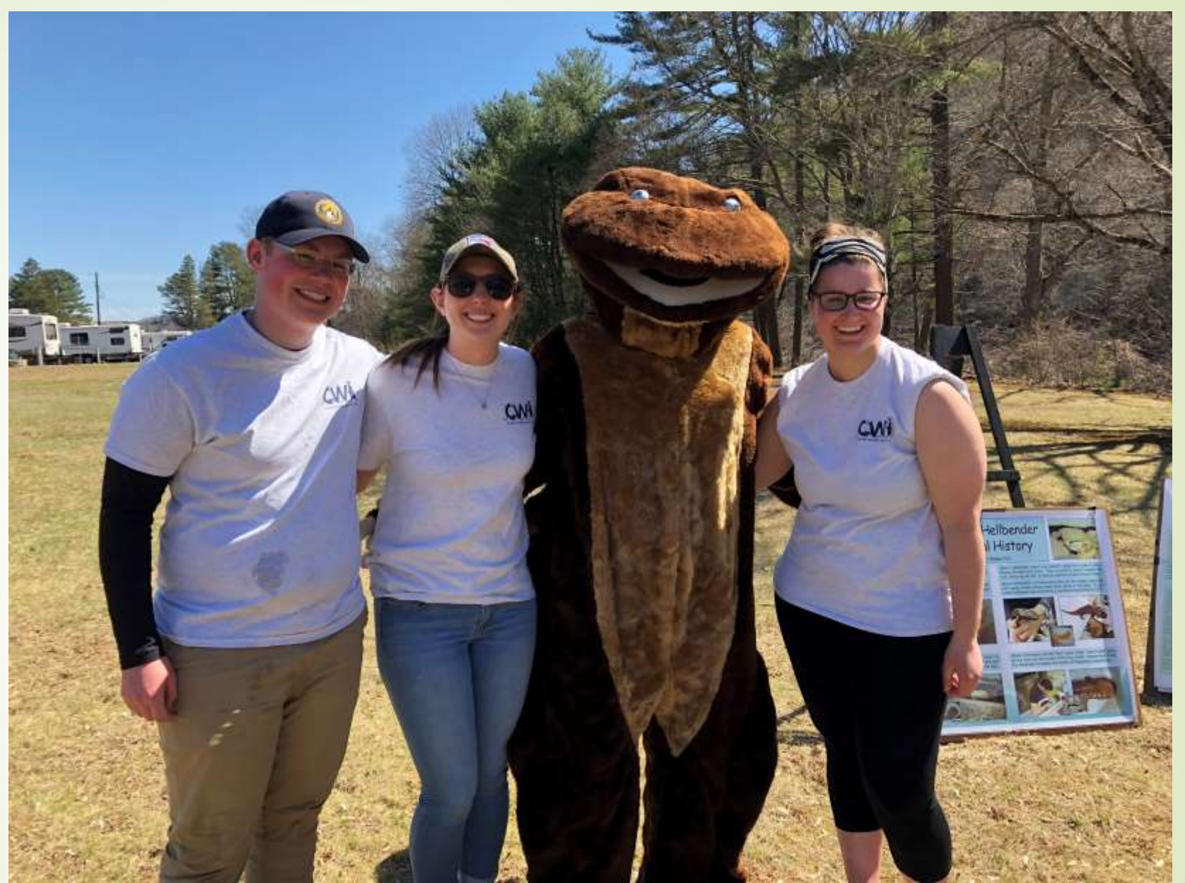
Lycoming College – Clean Water Institute provided various water quality programs as part of “Science on the Sock”.