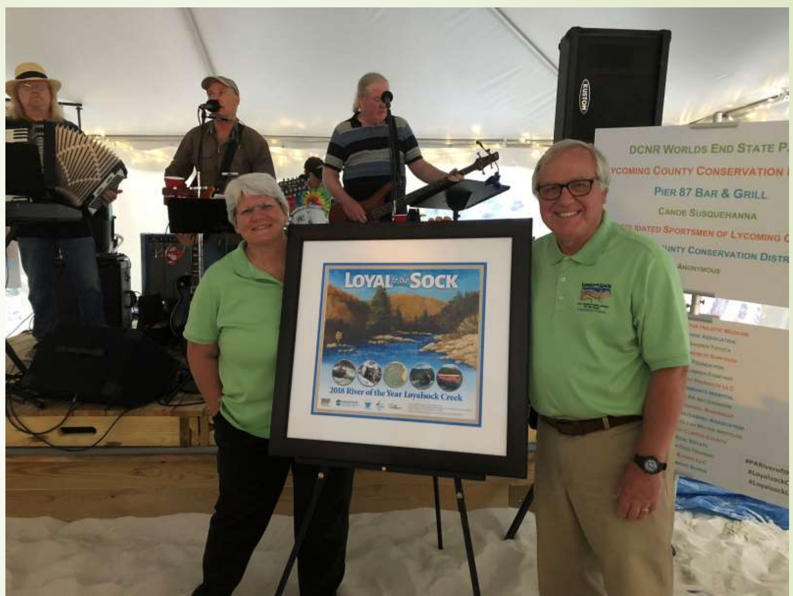
The 2018 River of the Year Celebration Kick-Off was held at Pier 87.